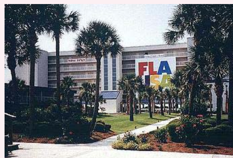
The Four Points Sheraton Destin-Ft. Walton is the location for Region Weekend next month.

The schedule includes Saturday workshops, free time, fun night and a Sunday Awards Luncheon. You